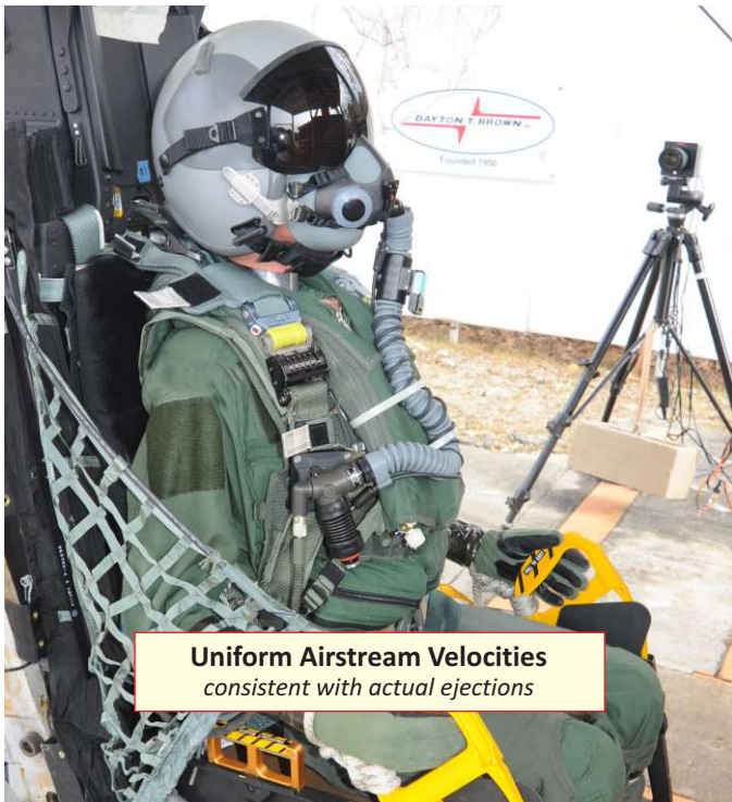
Uniform Airstream Velocities consistent with actual ejections

High-Speed Video · Advanced Data Collection · Components to Full-Scale Systems Testing